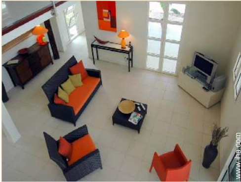
view from the mezzanine