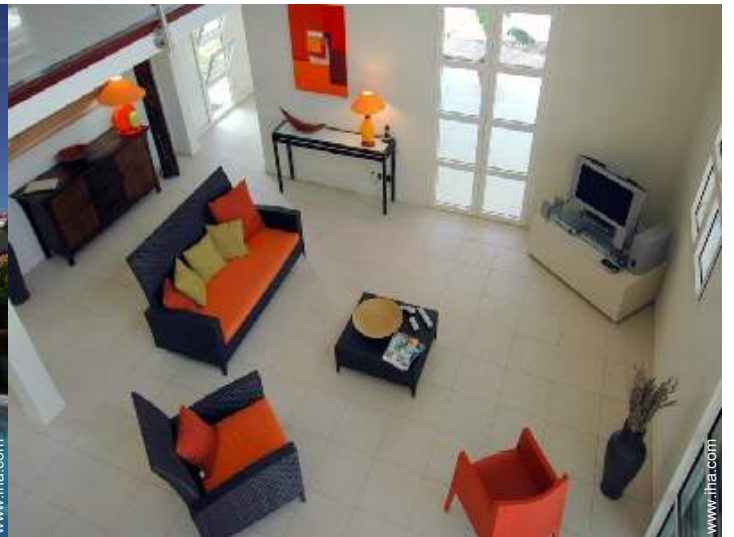
view from the mezzanine