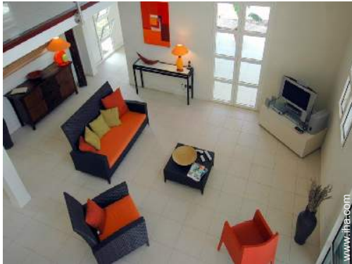
view from the mezzanine