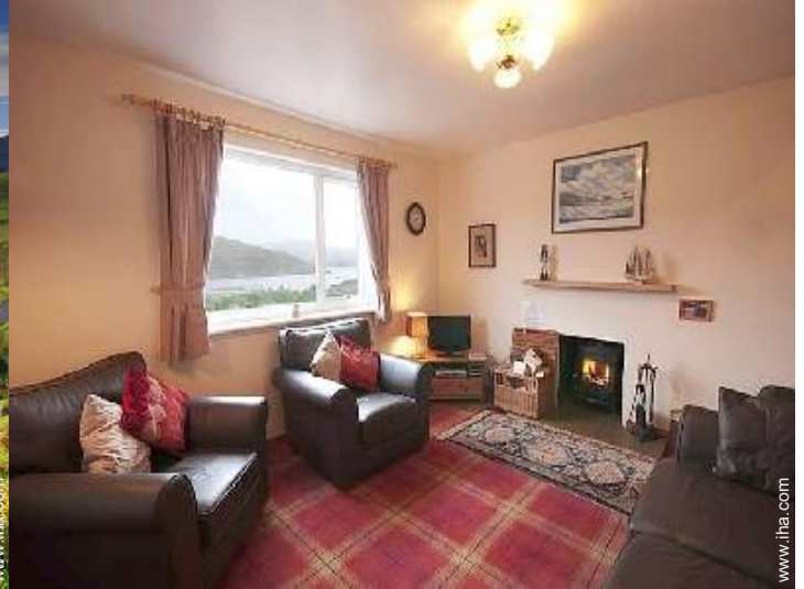
Interior comforts at guests disposal