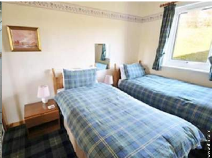
two twin beds