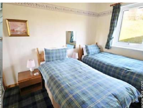
two twin beds