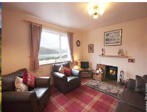
Interior comforts at guests disposal