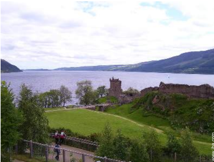
view over the lake