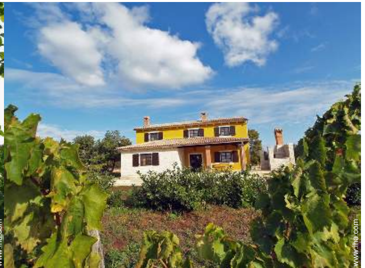
view over vineyard