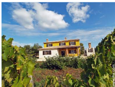
view over vineyard