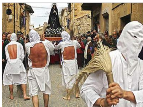
Cities close by