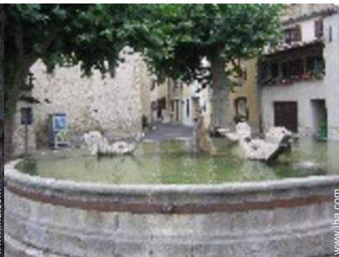
view of the village center