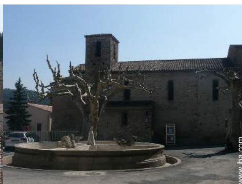
view of the village center