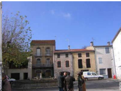
view of the village center