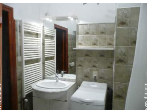
heated towel rail