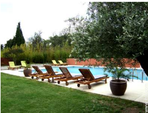
Rectangular swimming pool