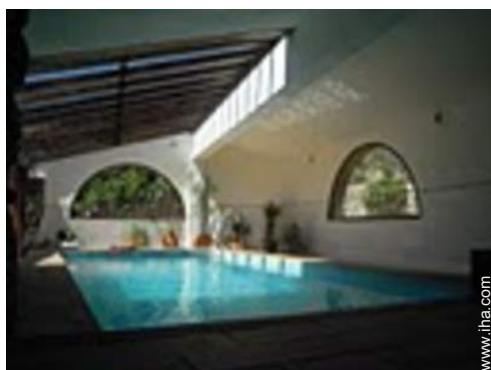
Inside swimming pool