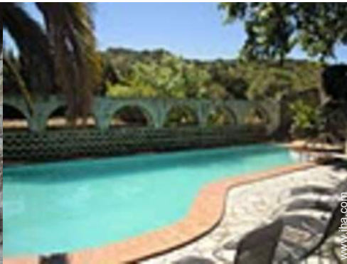
Original swimming pool