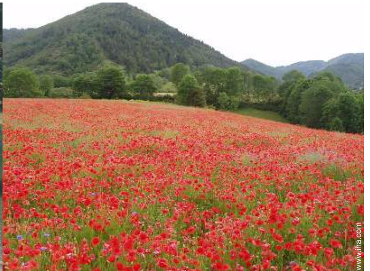
view from the patio