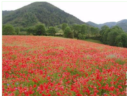
view from the patio