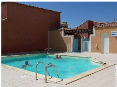
Exterior facilities at guests disposal