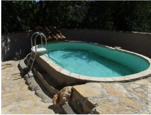
Oval swimming pool