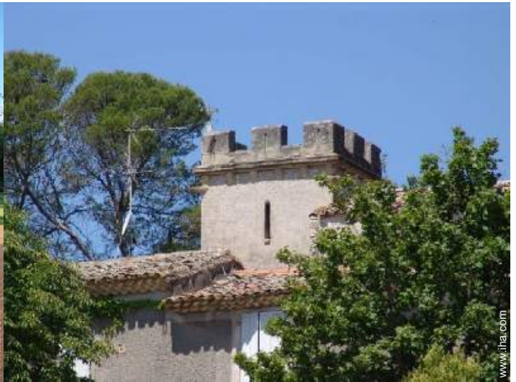
Luxury old Priory