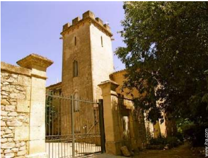
Luxury old Priory