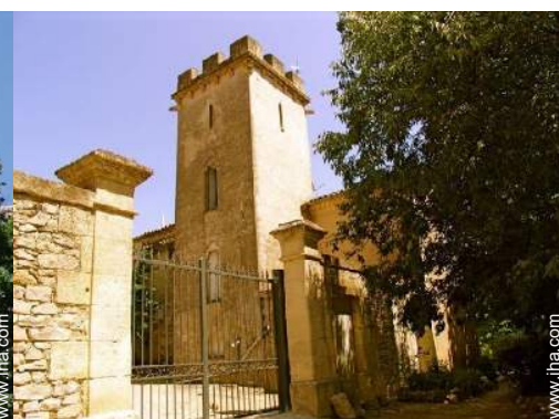
Luxury old Priory