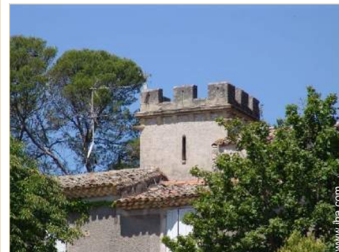
Luxury old Priory