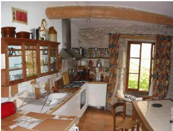
large separate kitchen