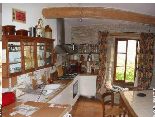
large separate kitchen