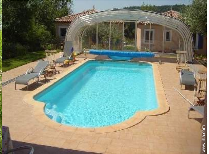
Rectangular swimming pool