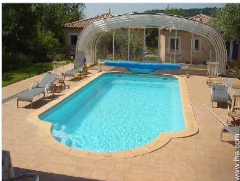
Rectangular swimming pool