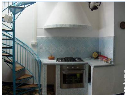
typical style kitchen