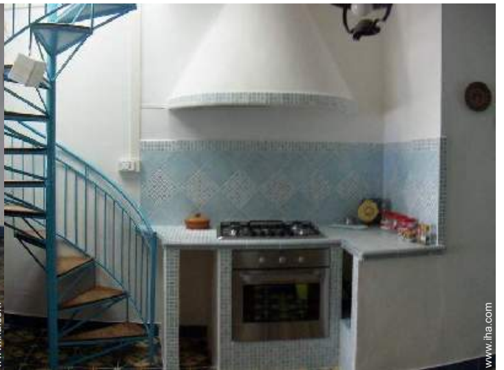
typical style kitchen