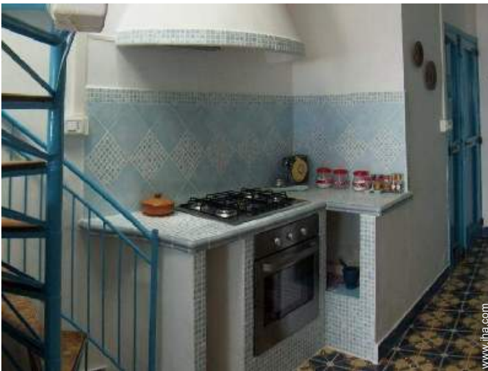
typical style kitchen