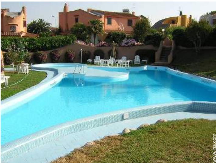
Original swimming pool