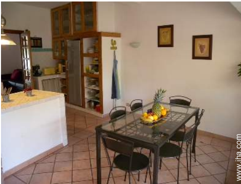
large seperate kitchen