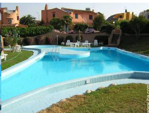
Original swimming pool