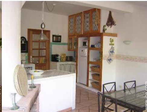
large seperate kitchen