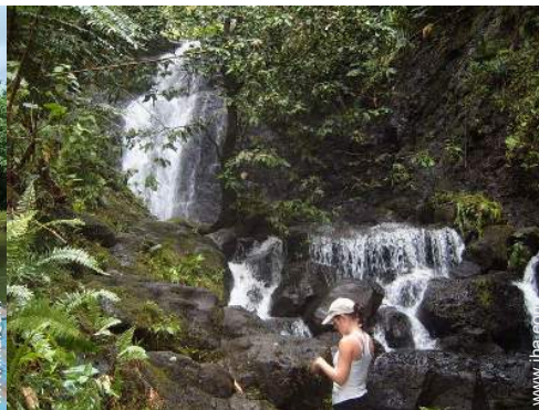
mountain pursuits nearby