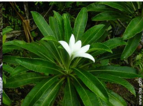
mountain pursuits nearby