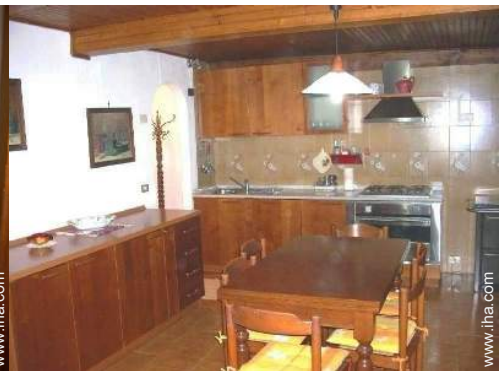
large separate kitchen