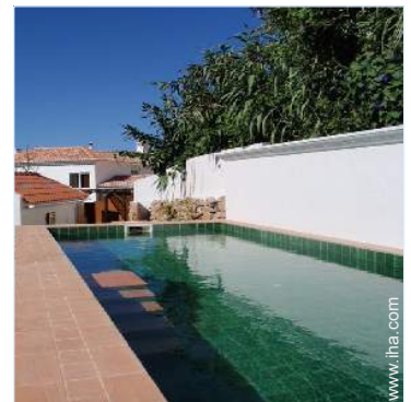
Exterior amenities at guests disposal