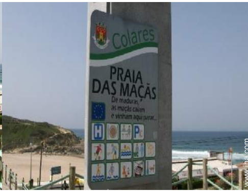
seaside pursuits nearby