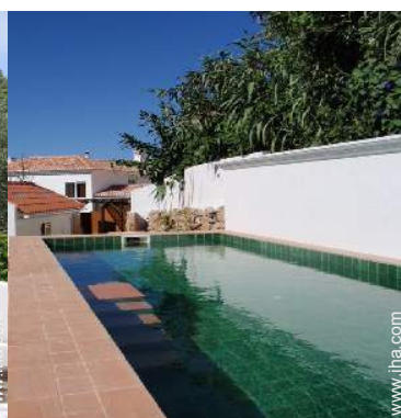
Exterior amenities at guests disposal