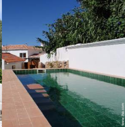
Exterior amenities at guests disposal