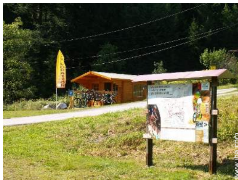
mountain pursuits nearby