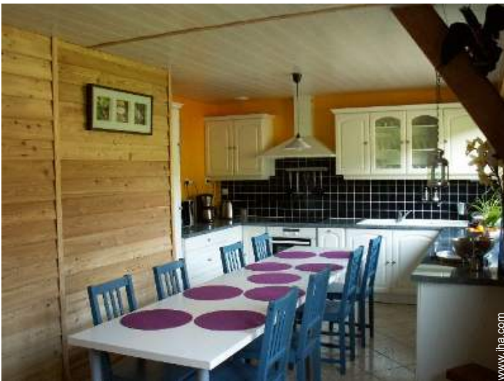
large american style kitchen