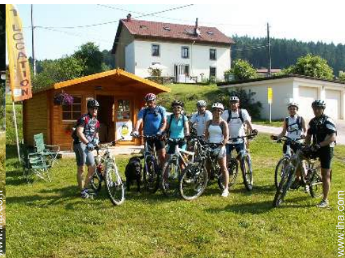
mountain bike (path)