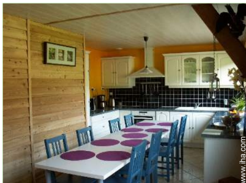
large american style kitchen