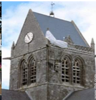
Cities close by