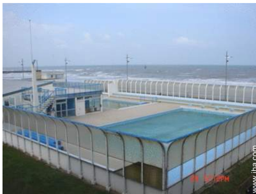
heated swimming pool