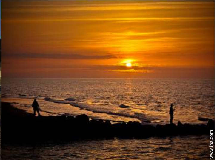
view over the ocean