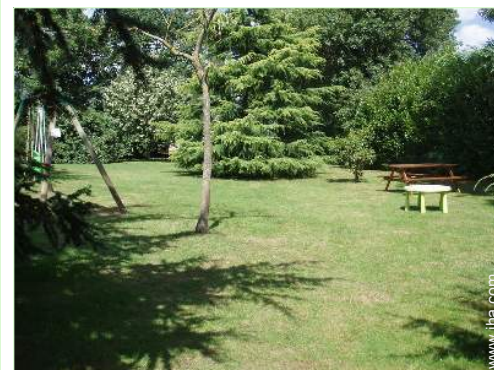
Outside at the guests disposal