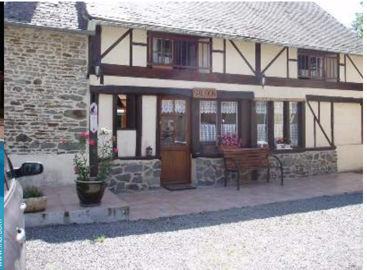
Charming Longère Farmhouse