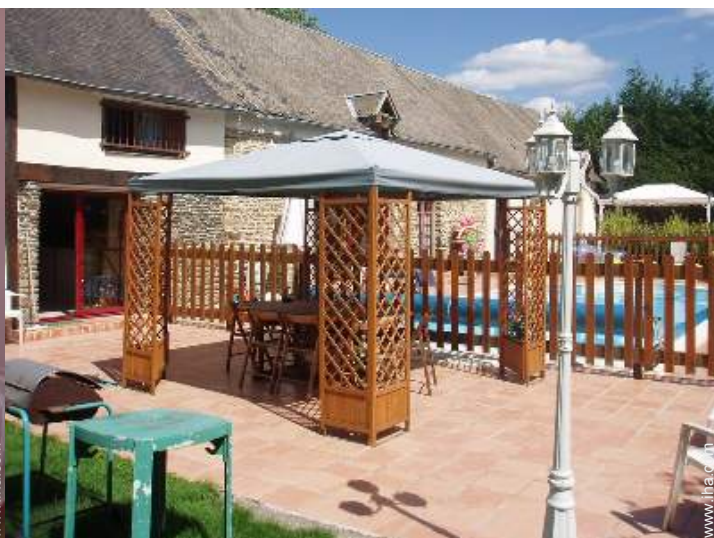
Exterior amenities at guests disposal