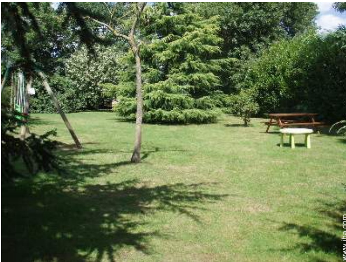
Outside at the guests disposal