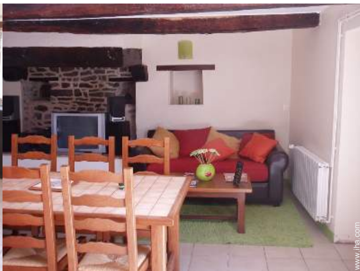
Interior comforts at guests disposal