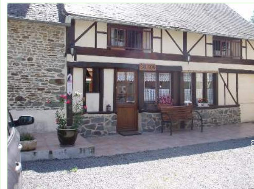
Charming Longère Farmhouse