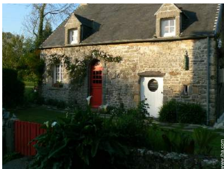
Charming Typical House