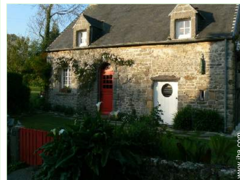
Charming Typical House