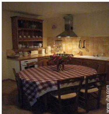
shared kitchen facilities