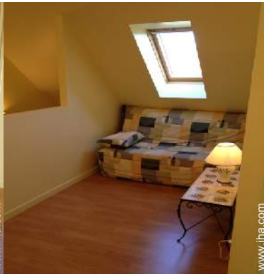
sleepers sofa(s) 2 pers