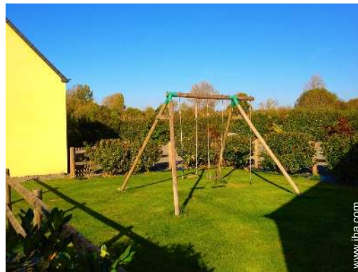
Exterior amenities at guests disposal