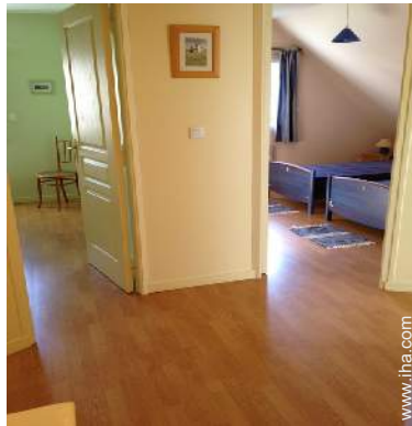
Interior comforts at guests disposal