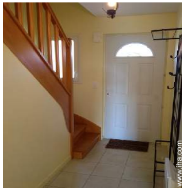
Interior comforts at guests disposal