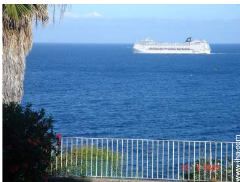
view over the ocean