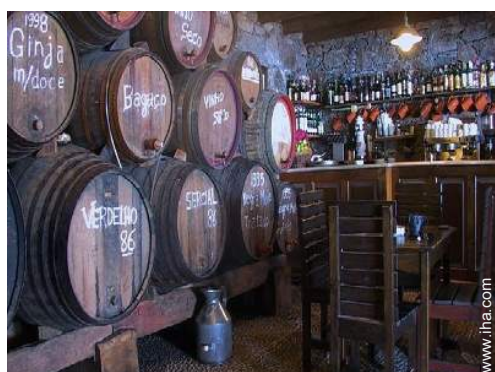
cellar and wine tasting