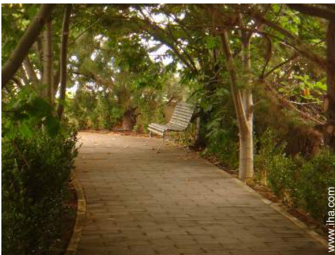
Outside at the guests disposal