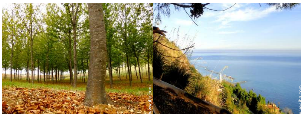
park and garden