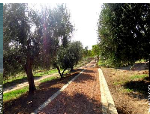
park and garden