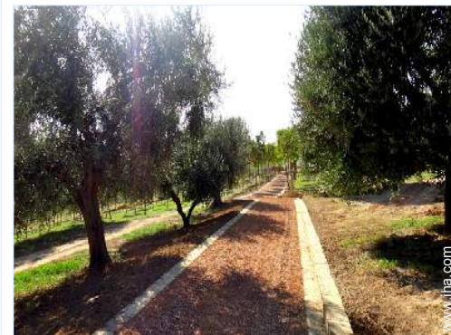
park and garden