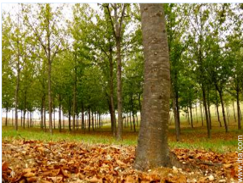
park and garden