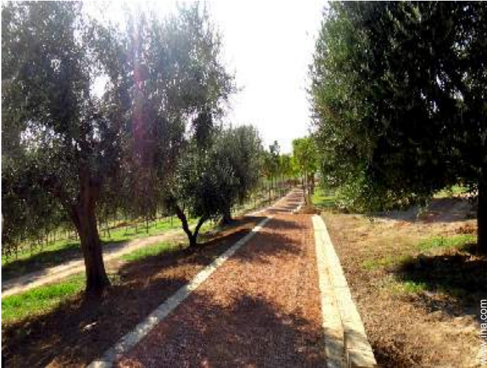
park and garden