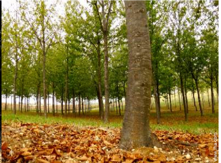
park and garden