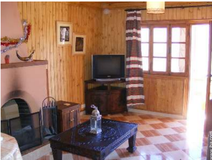
Luxury Mountain Chalet