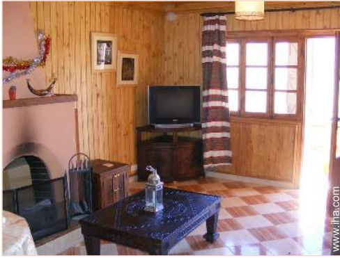
Luxury Mountain Chalet