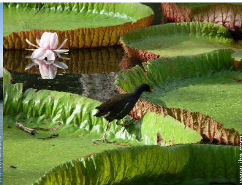
mountain pursuits nearby