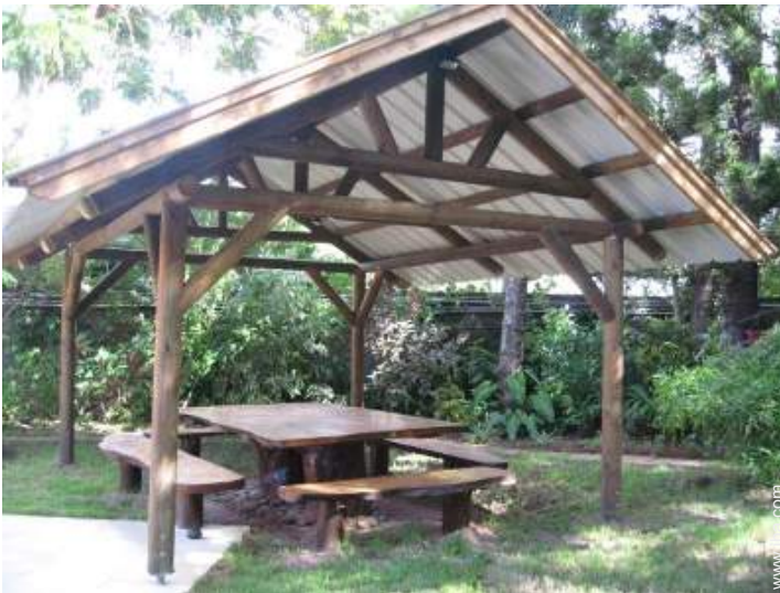
yard seated area