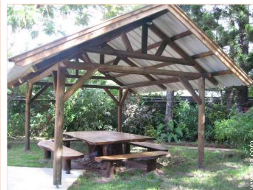
yard seated area