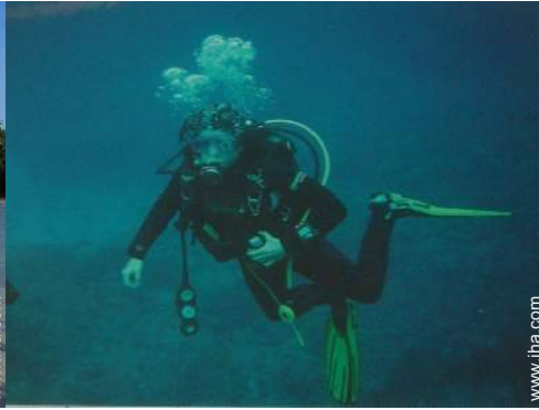
Scuba diving (Standard diving dress)