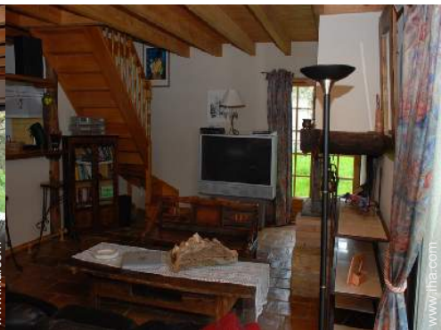
digital home cinema