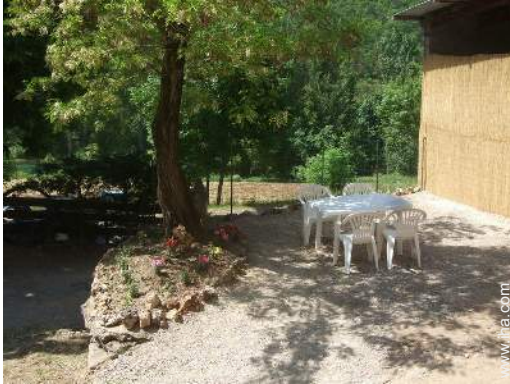
yard seated area