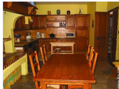
large separate kitchen