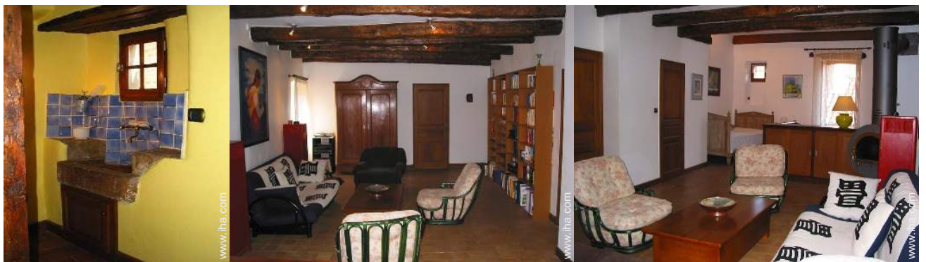
large seperate kitchen