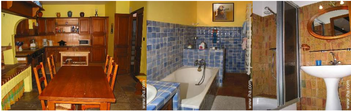
large seperate kitchen