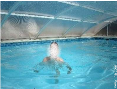
Covered swimming pool