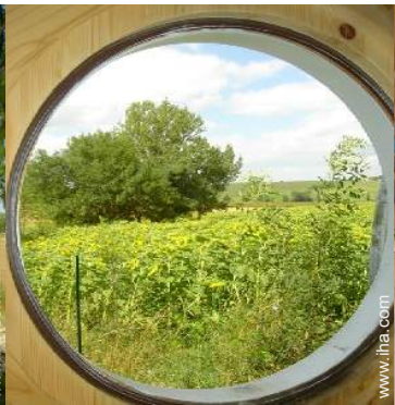
view over farmland