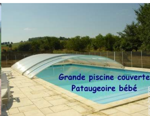
Covered swimming pool