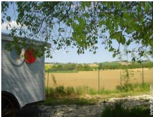
view over farmland