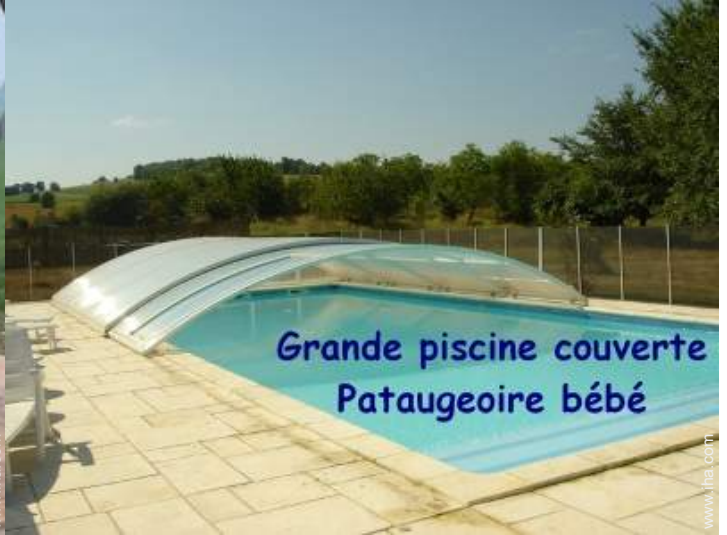
Covered swimming pool