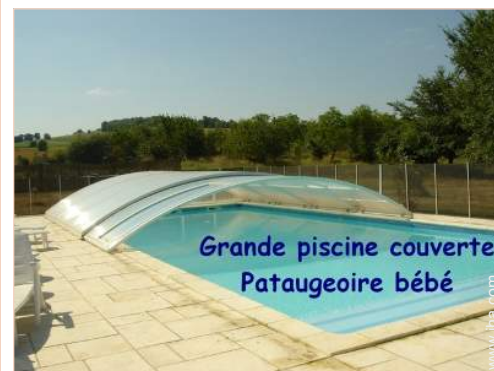
Covered swimming pool