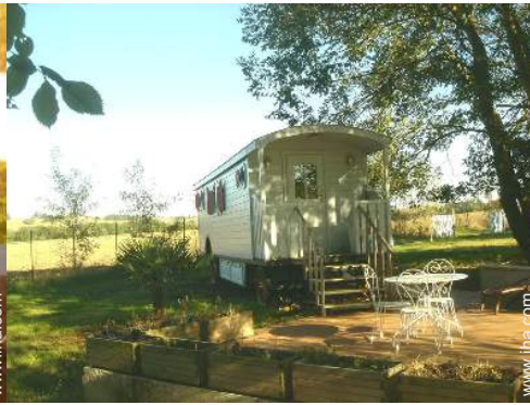
view over farmland