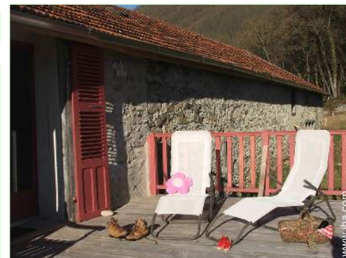
Charming Stone-Built House

BBQ, yard table(s), 6 yard seat(s), parasol, 5 chaise(s) longue(s)