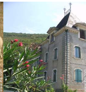
Outside at the guests disposal