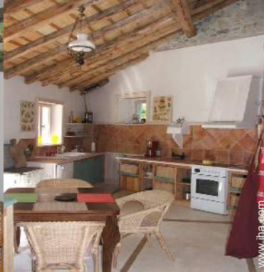
large sepearte kitchen