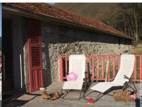
Charming Stone-Built House