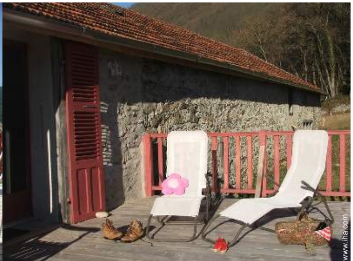
Charming Stone-Built House