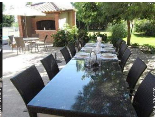
Exterior amenities at guests disposal