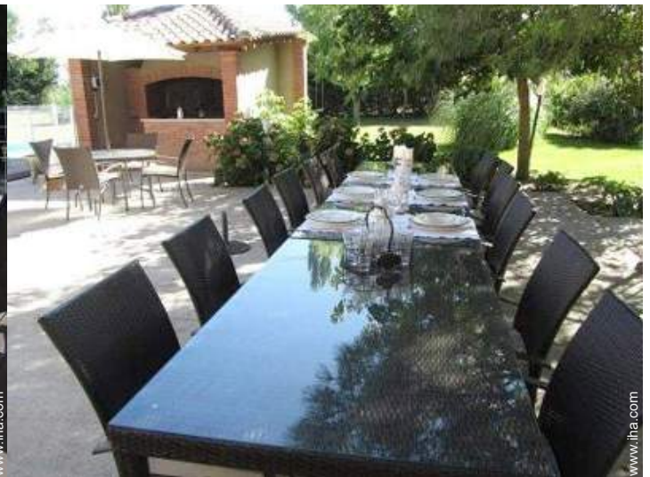
Exterior amenities at guests disposal