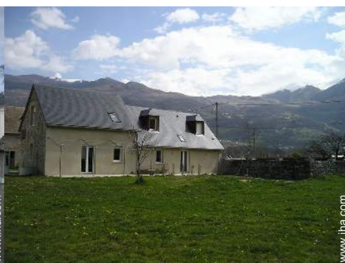
view over prairie