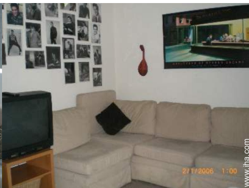
possible additional sleeping supplementary