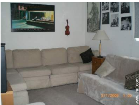
futon 2 pers