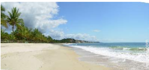
view over the ocean