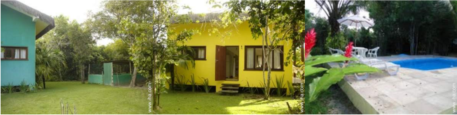
Oval swimming pool