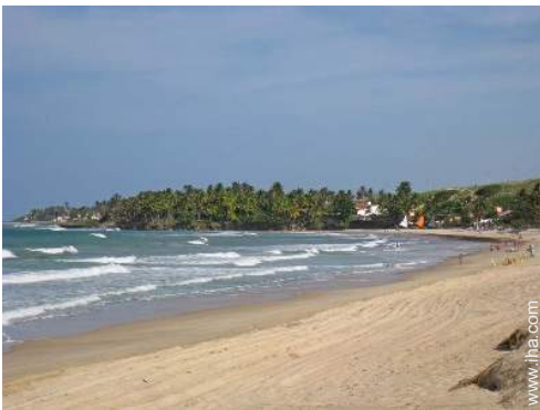
view over the ocean