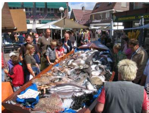
view of the village center