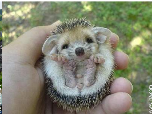
park and garden