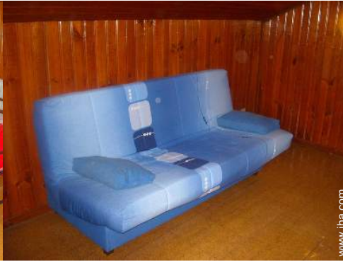
foldaway bed(s) 2 pers