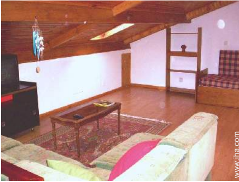
possible additional sleeping supplementary