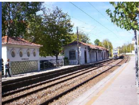
bus stop / bus station