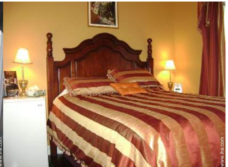
The chambre d'hôtes/B&#38;B