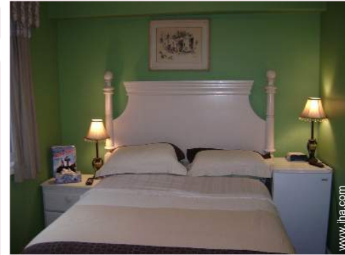
The chambre d'hôtes/B&#38;B