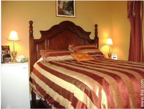
The chambre d'hôtes/B&#38;B