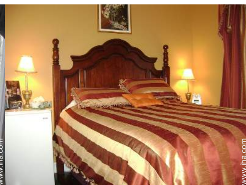
The chambre d'hôtes/B&B