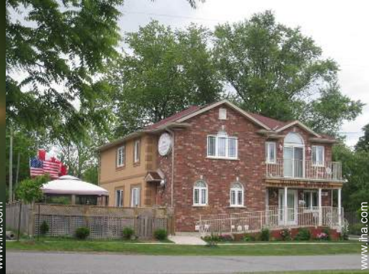
The chambre d'hôtes/B&B#38;B