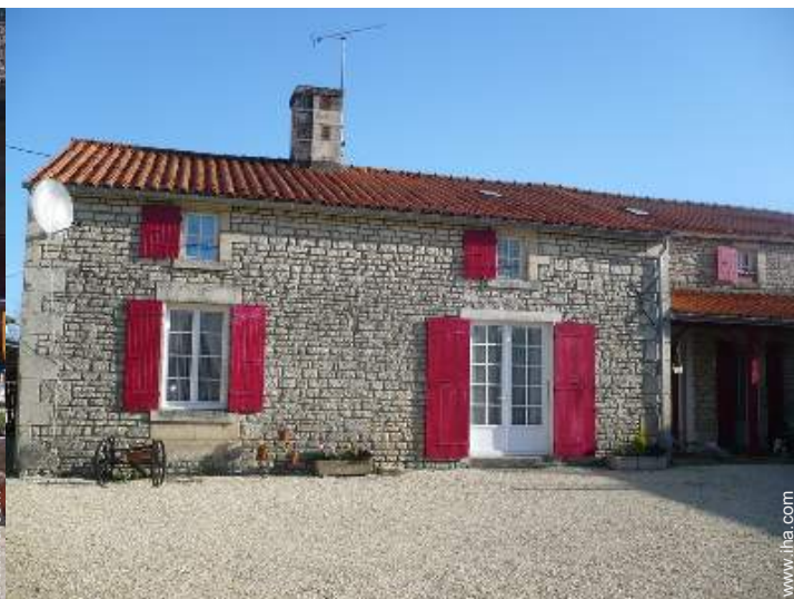
Charming Main Farm House