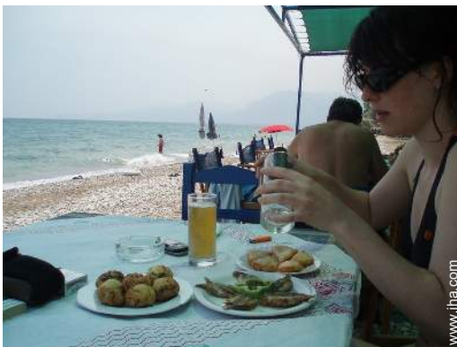
summer sports nearby