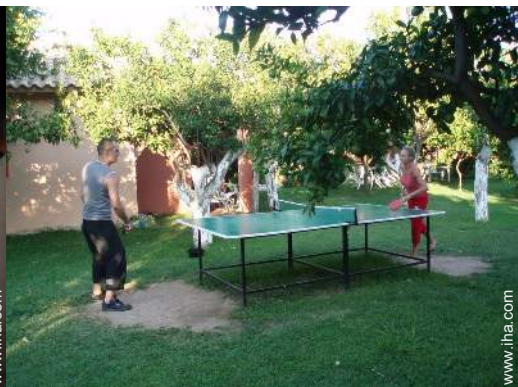
Exterior amenities at guests disposal