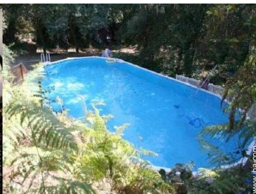
Rectangular swimming pool